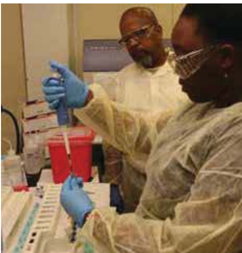
Students in a BD Good Start workshop